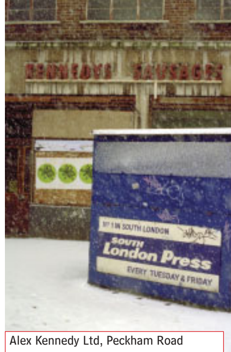
Alex Kennedy Ltd, Peckham Road