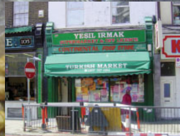
Yesil Irmak, Peckham Hill Street