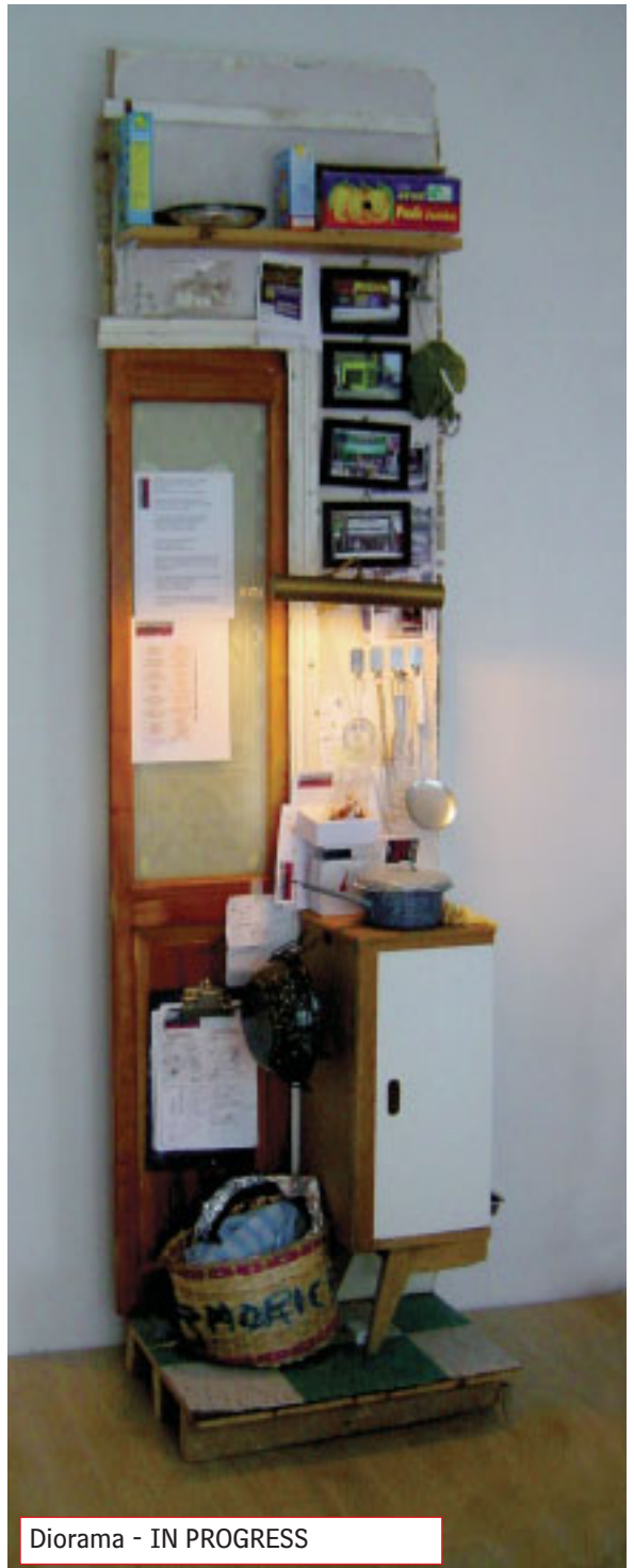
Diorama - IN PROGRESS