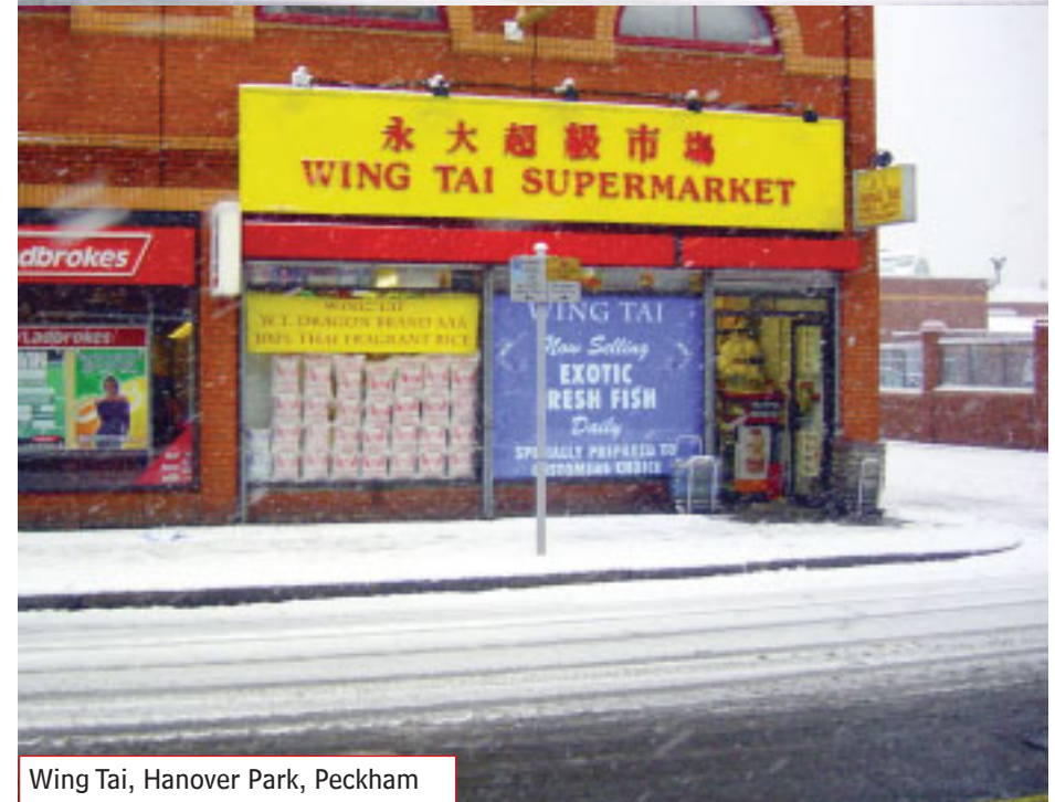
Wing Tai, Hanover Park, Peckham