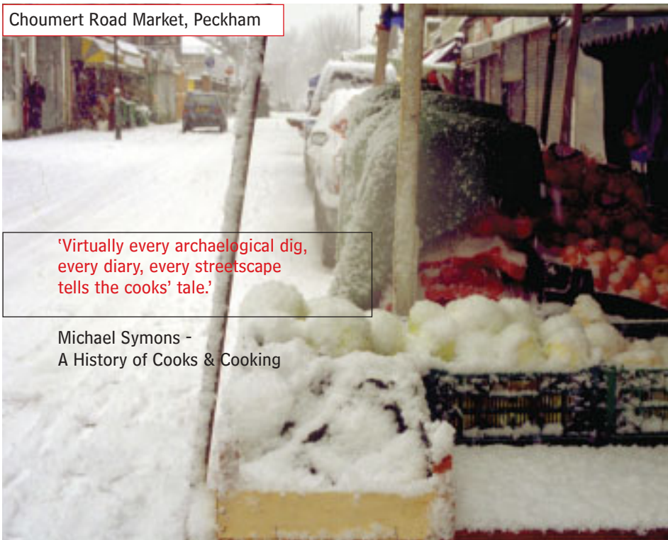
Choumert Road Market, Peckham

'Virtually every archaeological dig, every diary, every streetscape tells the cooks' tale.'