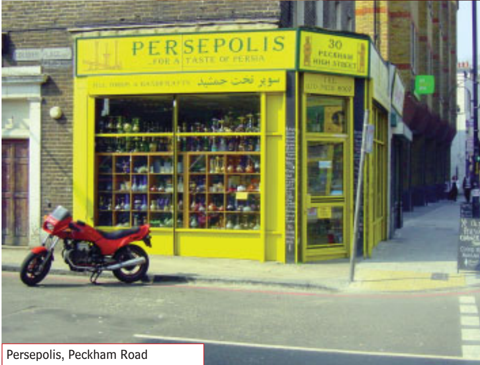
Persepolis, Peckham Road