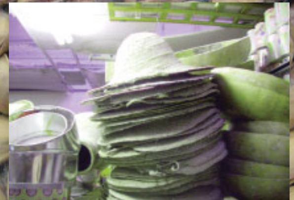
BIMS, Rye Lane

Cooking, 'it has never been sufficiently emphasised, is with language a truly universal form of human activity.'