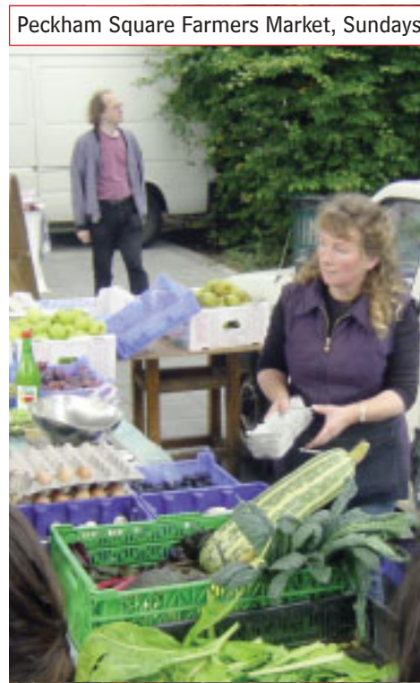
Peckham Square Farmers Market, Sundays